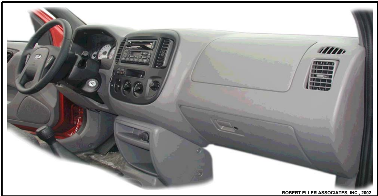
FORD ESCAPE SEDAN, Side View