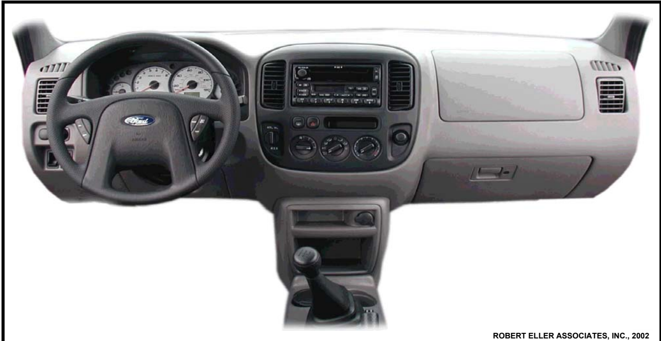
FORD ESCAPE SEDAN, Front View