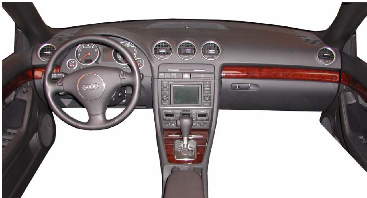
AUDI A4 II CABRIO ('02)