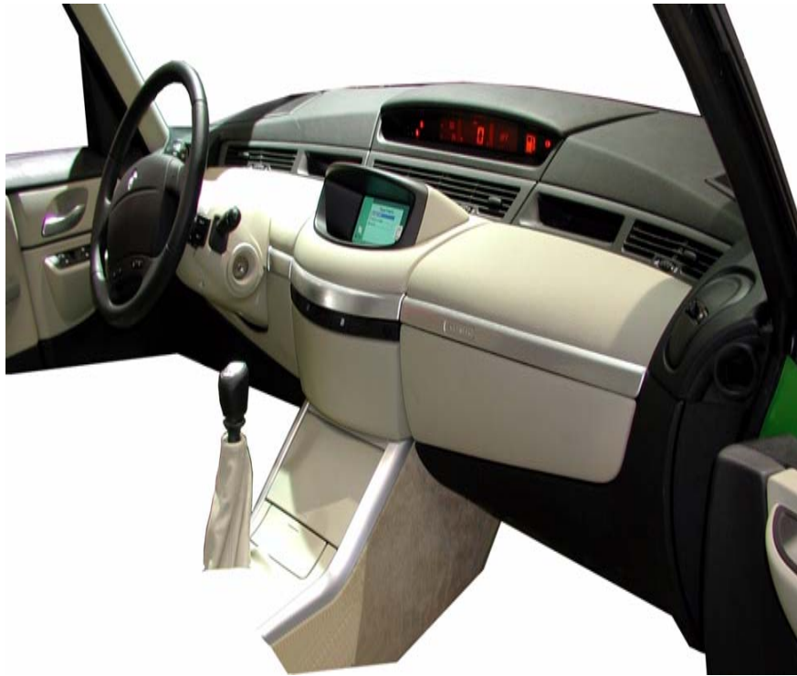
ROBERT ELLER ASSOCIATES, INC., 2002